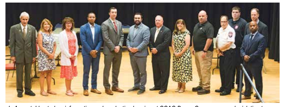
In August, I hosted an informative and productive hearing at CCAC Boyce Campus on my legislation to ease the tax burden on equipment that volunteer firefighters have to purchase themselves. Both statewide leaders and local first responders in my district gave valuable testimony at the hearing.

House Bill 2237 – This bill would provide a cost-of-living adjustment or COLA to retired municipal police officers and firefighters. This proposed COLA would add an additional $480 annually to the pension of an officer with 20 years of experience and 20 years in retirement. The last time the General Assembly provided a COLA to our retired public servants was nearly 20 years ago.